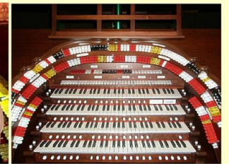
Console @ Lakewood Cultural Center