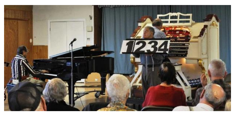
(Postponed), Holiday Hills Ballroom