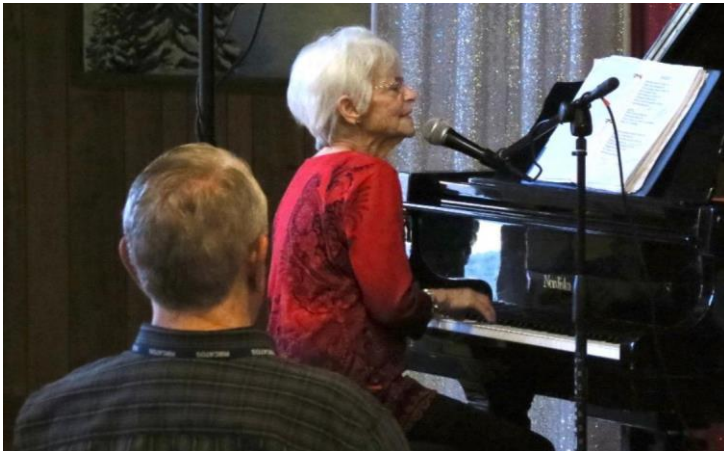
Pipes along the Rockies - December, 2018