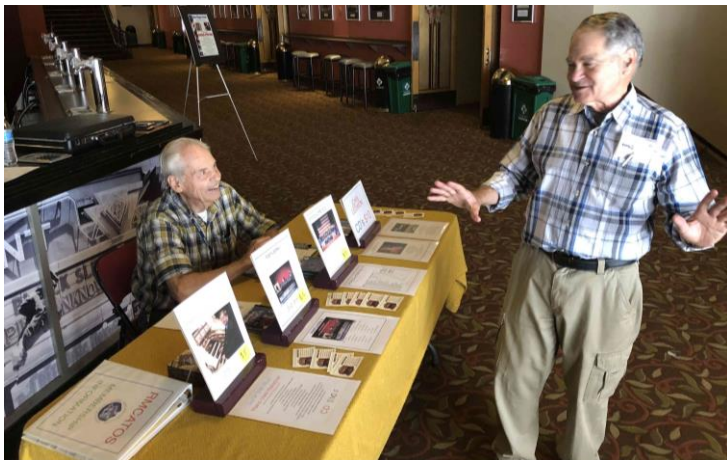
Pipes along the Rockies - September, 2018