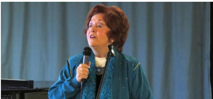
Pipes along the Rockies - March, 2018