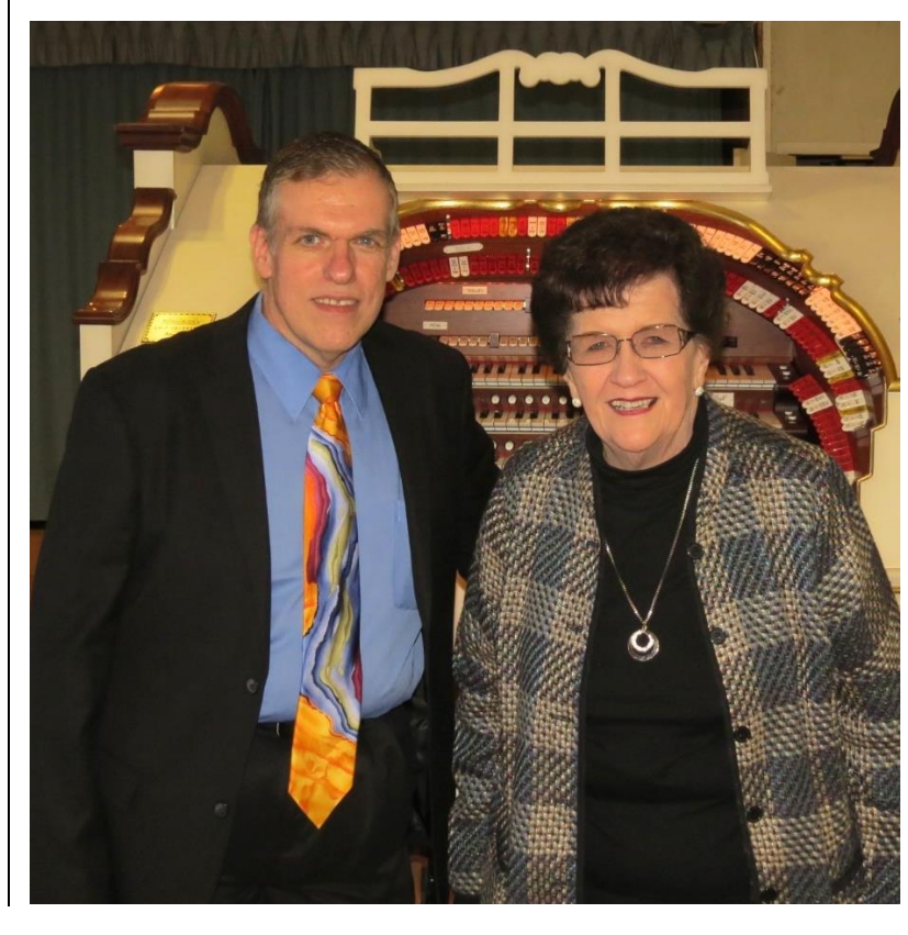
Pipes along the Rockies - March, 2016