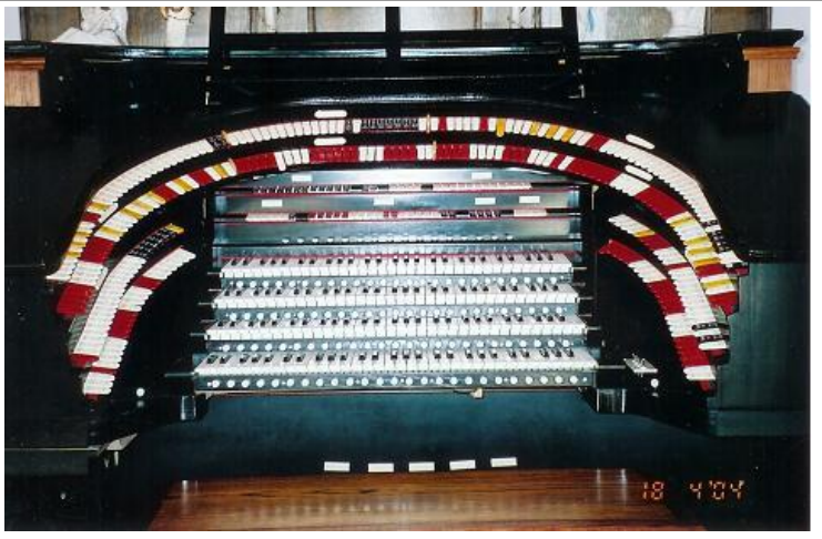
Largest Theatre Pipe Organ in Colorado