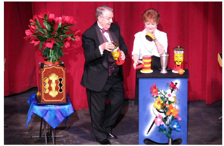
Poof!!! The Spanglers will be Back!