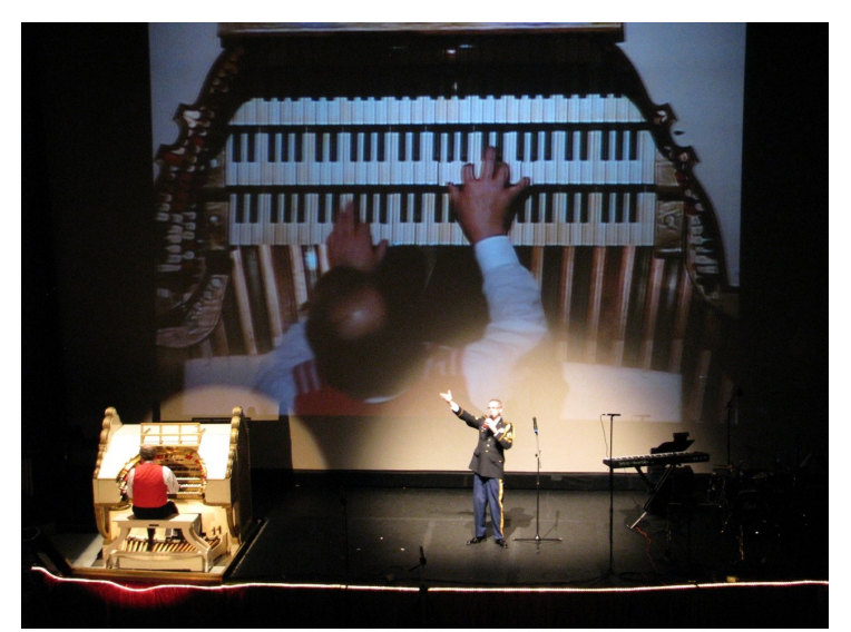
Additional photos can be found on the club website: www.RMCATOS.org Click on "What's New"