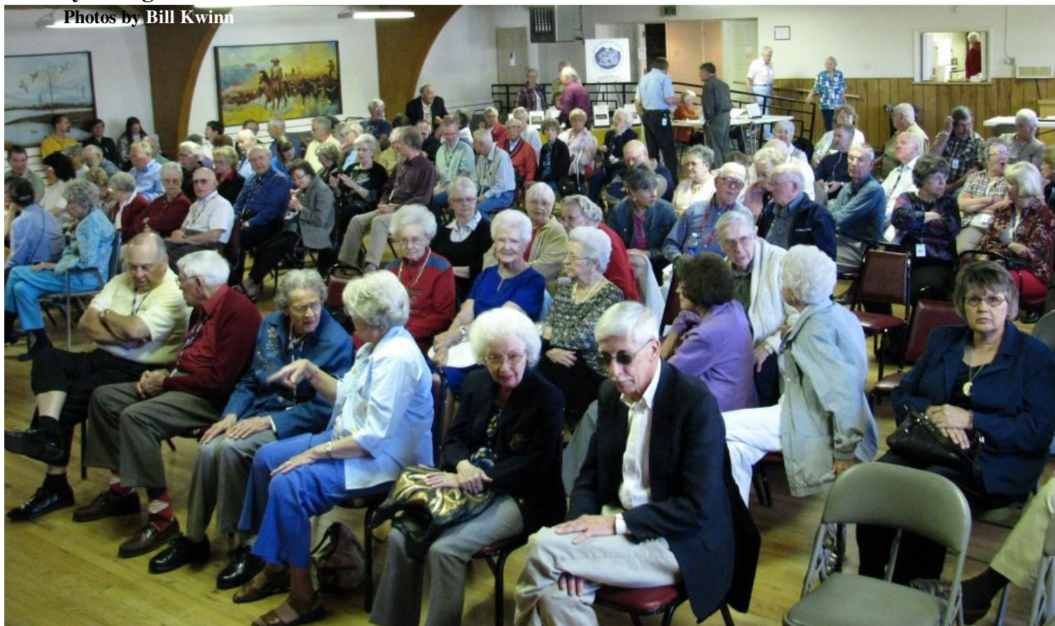
Pipes Along the Rockies - June, 2010