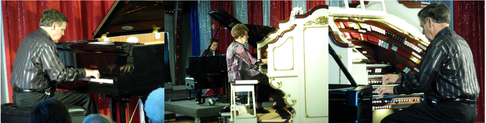
“Got Gospel?”